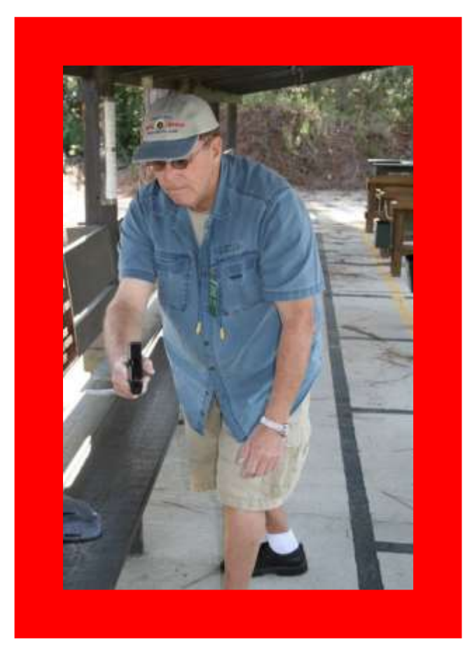
Figure 13: Demonstration of unsafe conduct of guest with uncased pistol behind the firing line

1.11. When firing is complete, ensure you and your stand-in guest sign out at the Entry Control Point. Drop the guest badge into the lock box at the guest sign-in area.