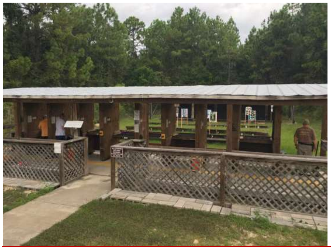
Figure 16: Only firing lanes 3, 8 and 10 are authorized for Restricted Pistol training on Range A.