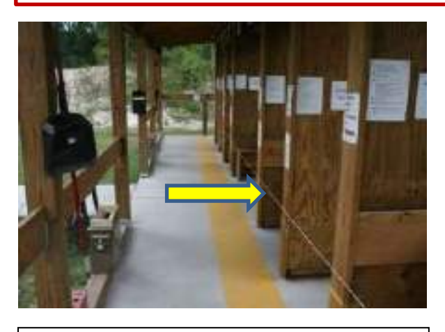
Firing Line Isolation Cables must be fully deployed before a firing line can be declared "COLD". Firing lines cannot be partially "HOT" or "COLD"" at any time.

3.6. SAFETY LINE: A yellow line defines the aft limit of each firing stall. This line acts as a transition area, forward of which firearms may be uncased. A manually-deployed firing line isolation cable inhibits access to firing stalls when the line is "COLD".