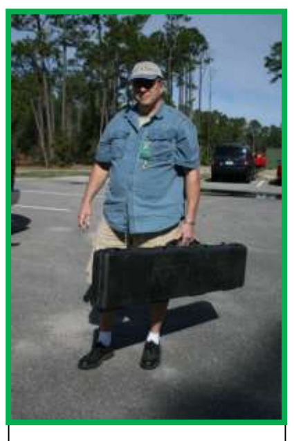
Figure 9. Authorized: Transport of cased firearm to/from firing line.

f) When ready to depart the firing line, the LOADED/SECURED handgun must be again placed into a LOADED/CASED condition (while on a "HOT" firing line, forward of the yellow line) before leaving the firing line.