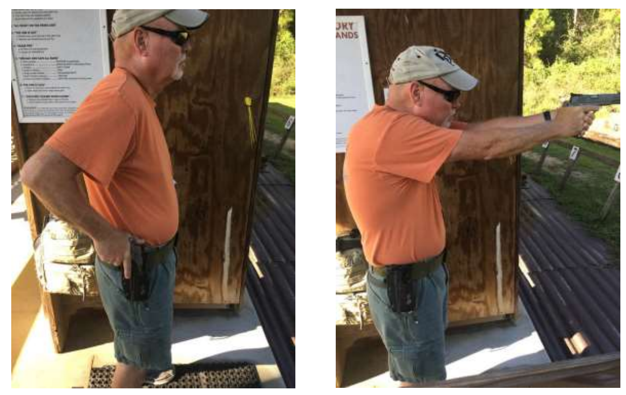
Figures 14 & 15: Member demonstrating use of authorized holster and firing stance