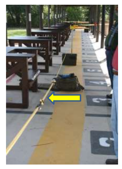
Figure 5. Range B Firing Line Isolation Cable