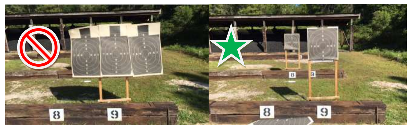
Figure 7. Improper target placement