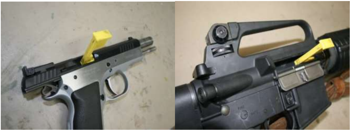
Figure 12. Examples of properly installed Empty Chamber Indicators

5.7. Empty Chamber Indicator: Empty Chamber Indicator (ECI) use is mandatory anytime an uncased firearm is placed on a "COLD" firing lane. If an ECI cannot be inserted into the chamber of cleared firearm, it will, instead, be placed in a position to restrict operation of the firearm.