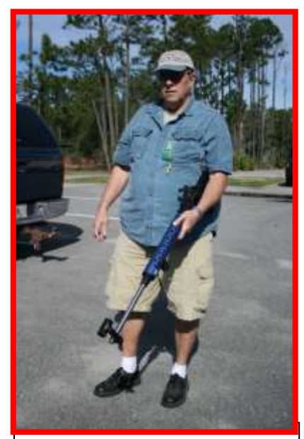
Figure 10. Prohibited: Possession of uncased/unsecured firearm when not on firing line