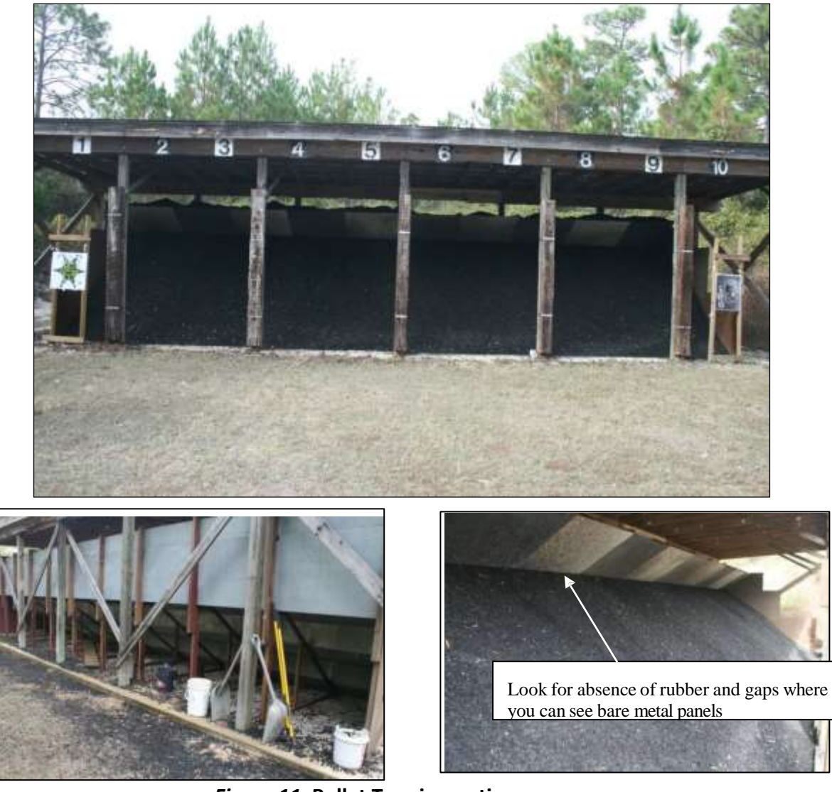
Figure 11. Bullet Trap inspection.

4.8. Range inspection log : After completion, print your name and date, and any discrepancies found, on the daily inspection log located in the range Entry Control Point of the specific range.