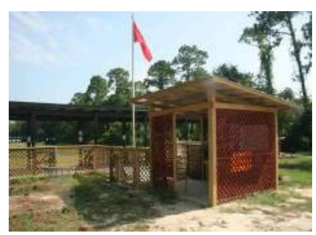
Figure 3. Range B Entry Control Point

3.1. Club House: The facility is accessible by all club members via lock box on the Club House door.