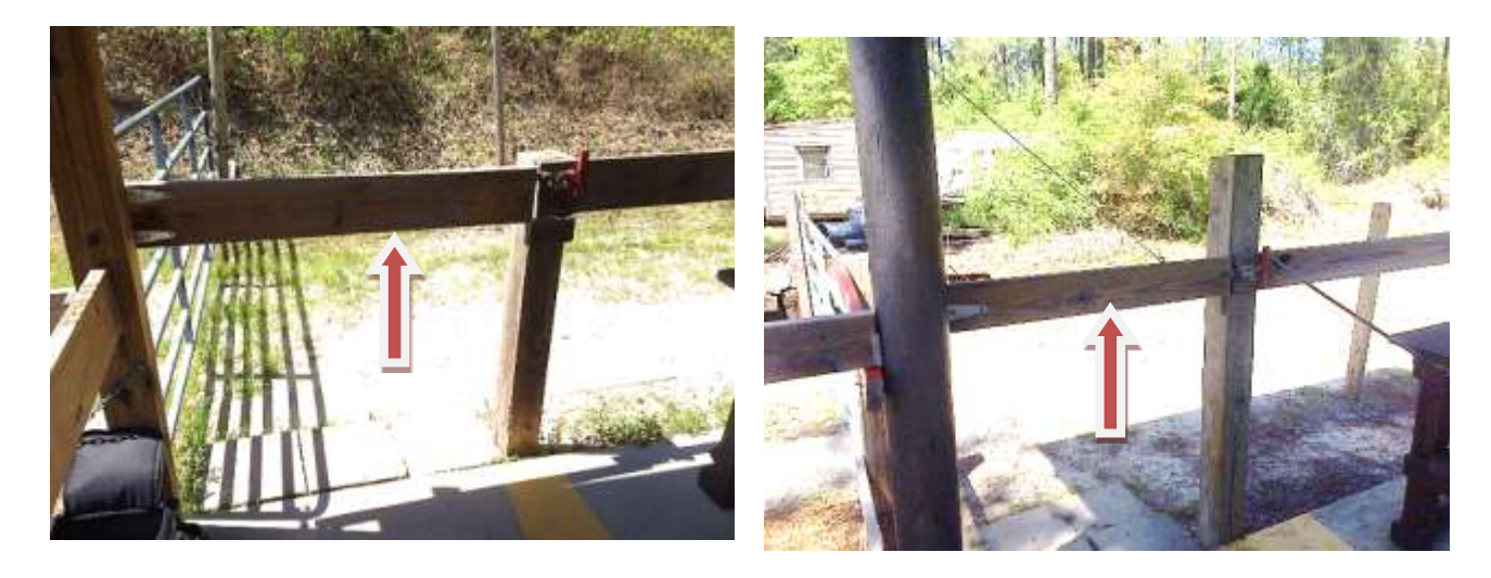
Figure 6. Single-point down-range access gates: Range A (left) Range B (right)