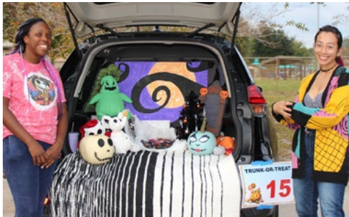
Last year's Fall Fest